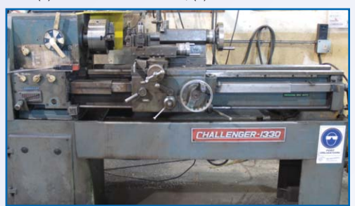
CHALLENGER 13X30" LATHE

Also: (2) Jib cranes with hoists, (2) Pneumatic sheet lifters