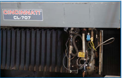
CINCINNATI CL-707 CUTTING HEAD