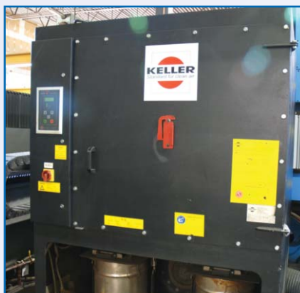
KELLER L-CUT 2P5 FILTRATION SYSTEM