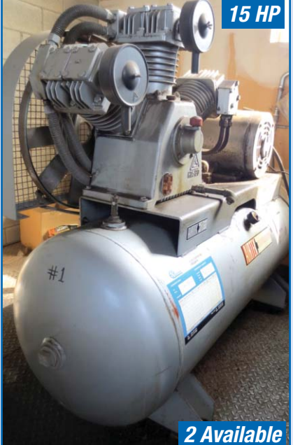
AIRTEK HT 25I20 AIR COMPRESSORS