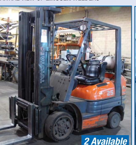
TOYOTA LPG FORKLIFT