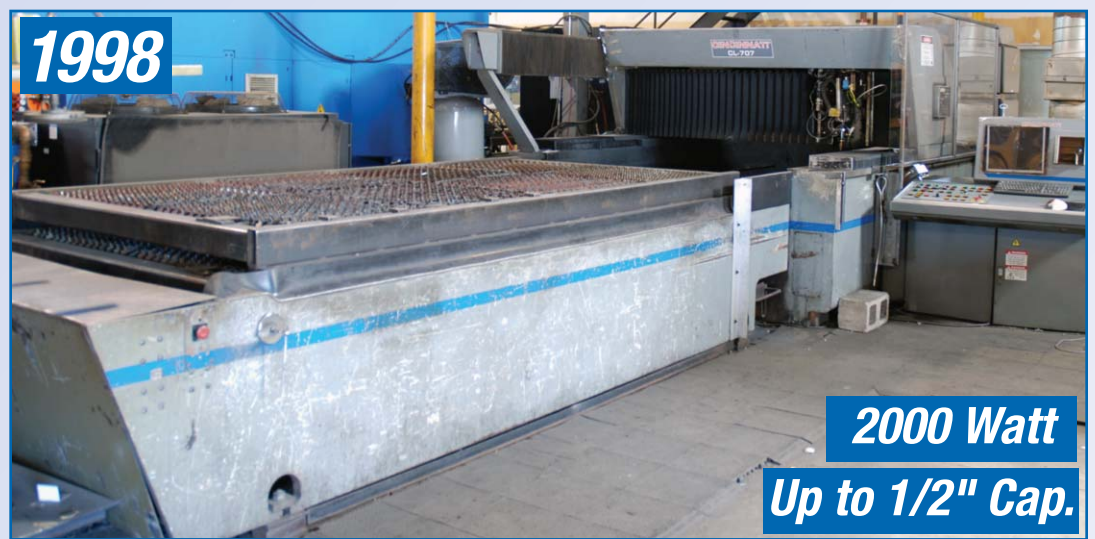
CINCINNATI CL-707 CNC LASER