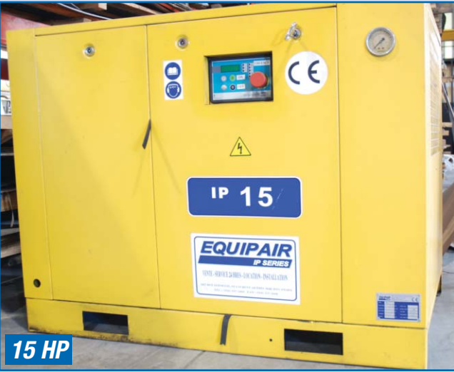
EQUIPAIR ROTARY SCREW AIR COMPRESSOR