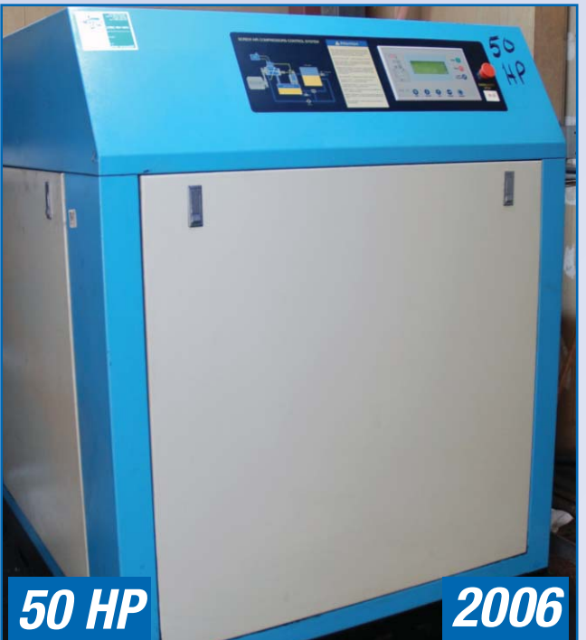
SCREW COMPRESSOR 50A-5.6/10 COMPRESSOR