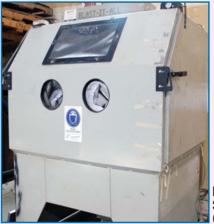
BLAST-IT-ALL SHOT BLAST CABINET