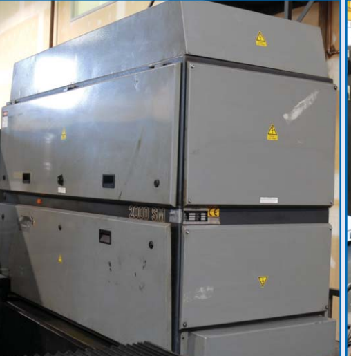
CINCINNATI CL-707 RESONATOR