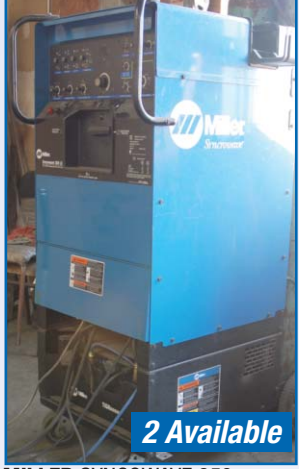
MILLER SYNCOWAVE 350

This brochure is meant merely as a guide. Infinity Asset Solutions makes no guarantee, expressed or implied, as to the accuracy of the information in this brochure. Buyers should inspect the goods beforehand to satisfy themselves.