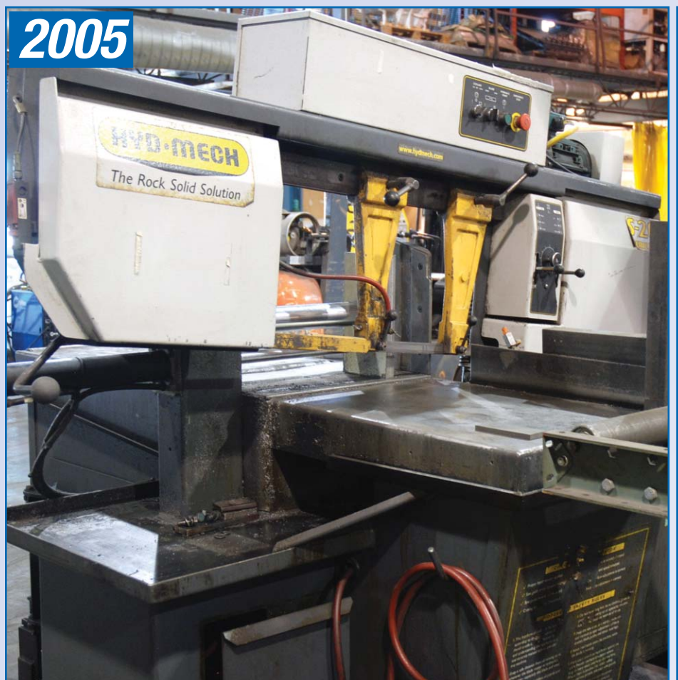
HYD-MECH S-20 SERIES II SAW