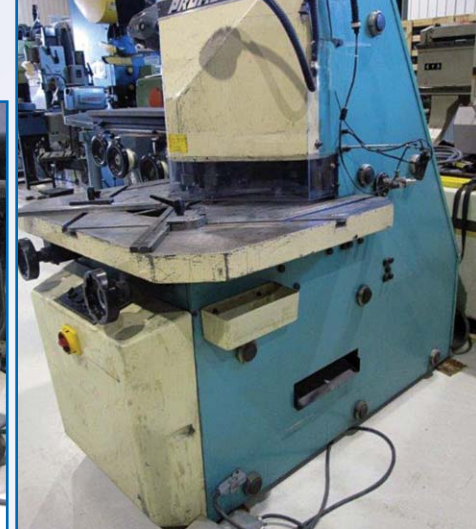
WELDFAXX CHAMPFERING MACHINE