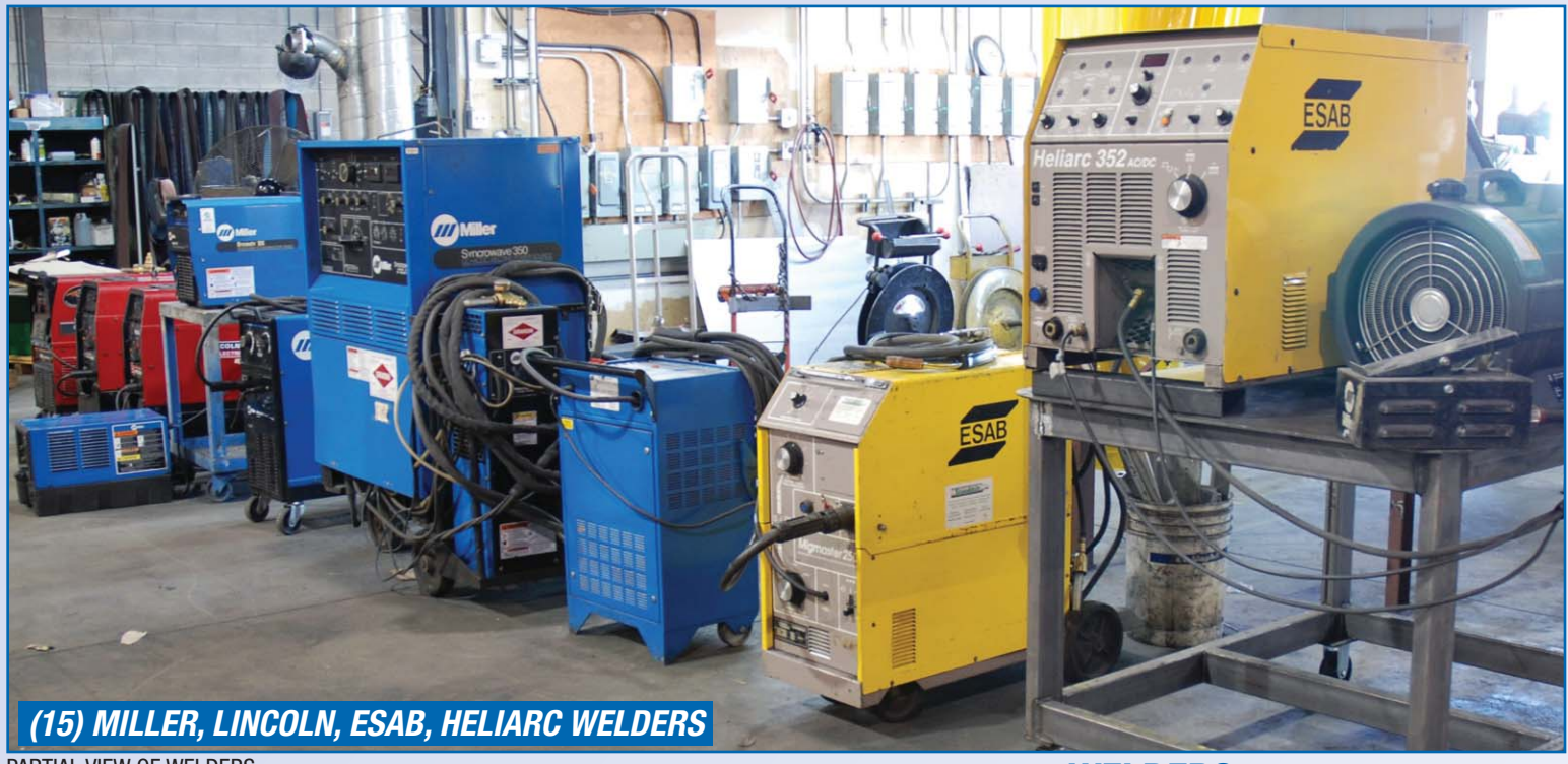
PARTIAL VIEW OF WELDERS