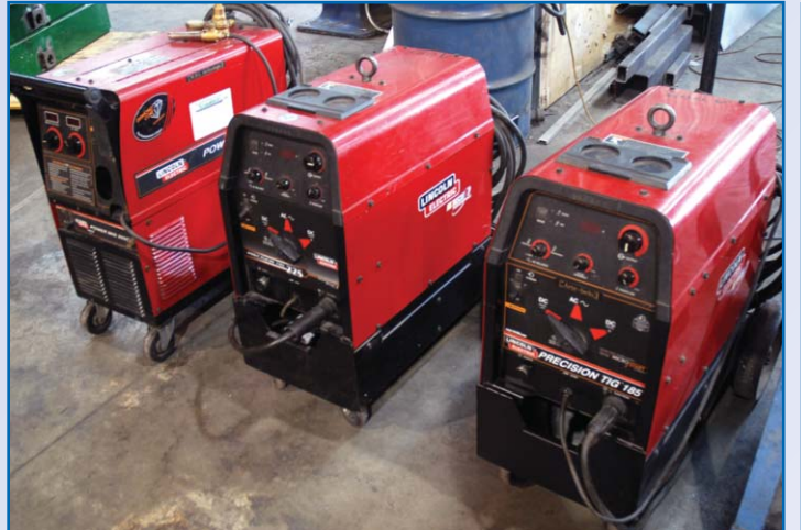
PARTIAL VIEW OF LINCOLN WELDERS