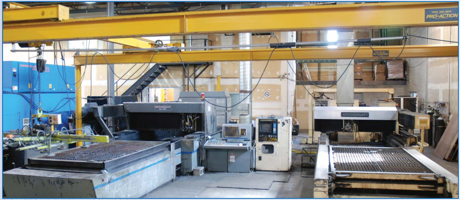
CNC LASERS AND FREESTANDING CRANE SYSTEM