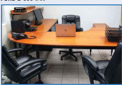
PARTIAL VIEW OF OFFICE FURNITURE